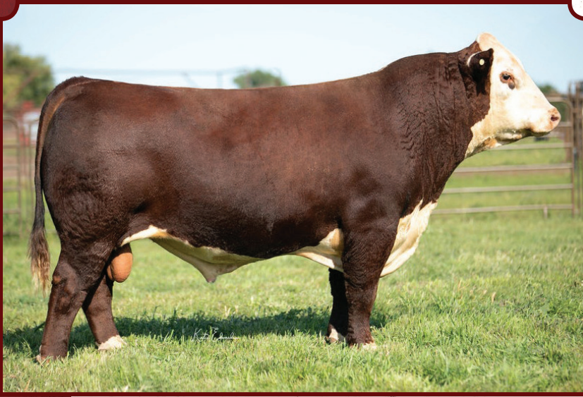
TH FRONTIER 174E