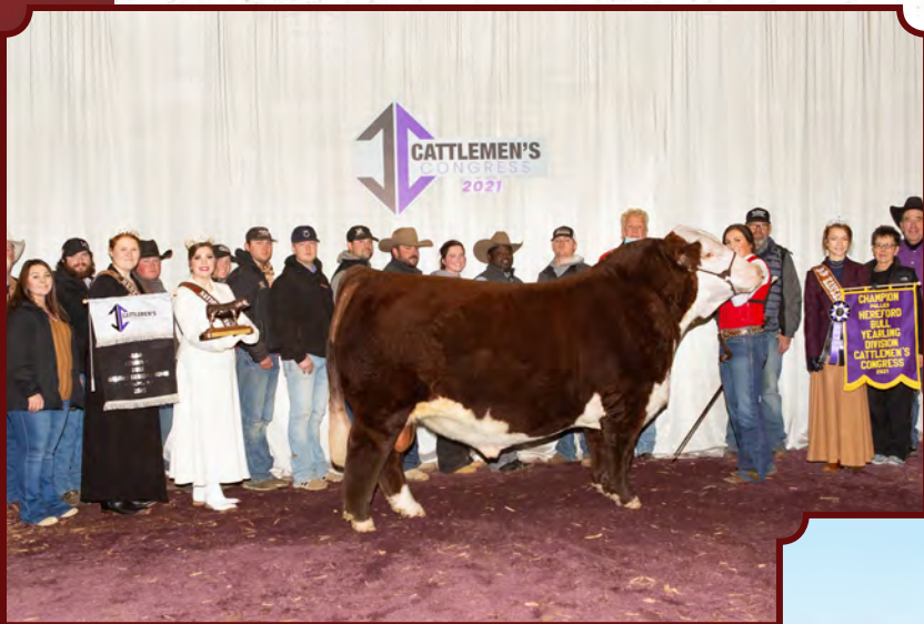
HAROLDSON'S UNITED 33D 36G