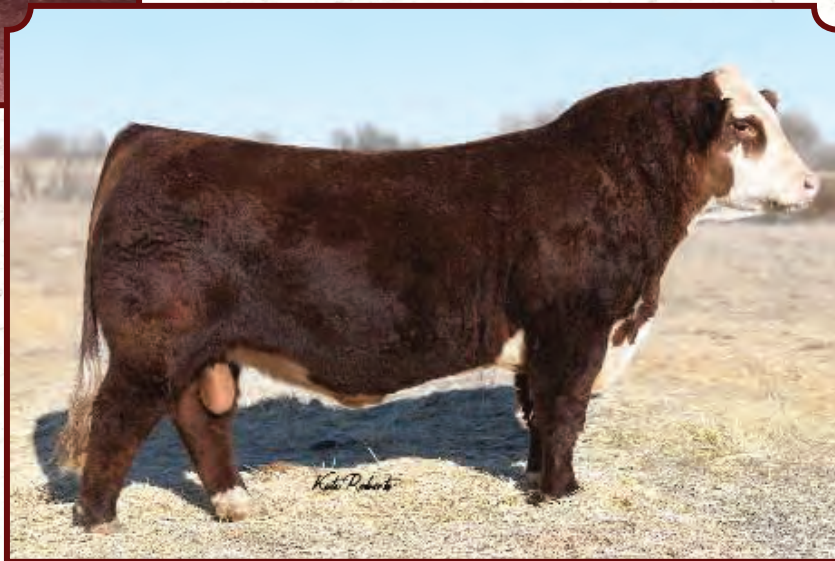
CHURCHILL RED BARON 8300F