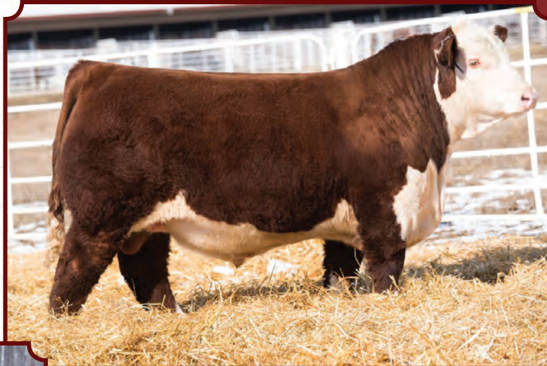
ANL 17A HI TECH 58W 80C